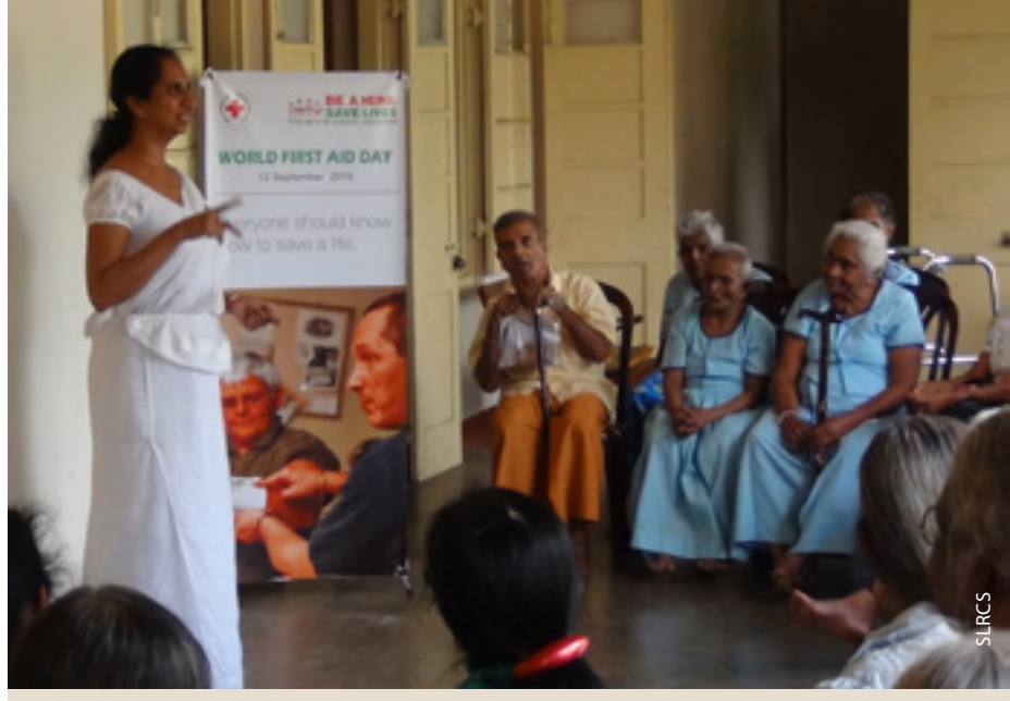
Elders of the Thusitha Elders Home, Homagama, at the introductory first aid training.

Ninety elders and their caregivers learnt what to do in the event of a fracture, heart attack, an asthma attack, and bleeding. They learnt first aid for choking, and the