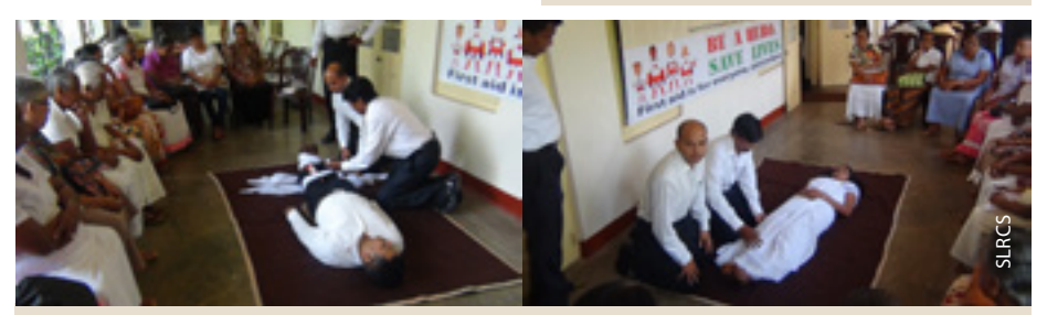
First aid instructors demonstrate how to transport an injured person in need of further medical treatment (right), and how to take care of a fracture (left).