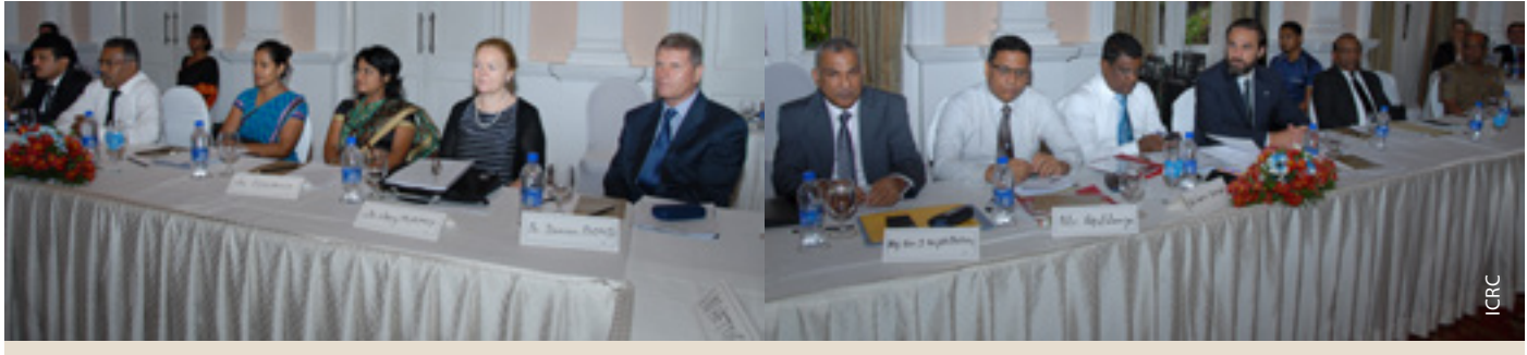
Participants at the roundtable held earlier this year.

Authorities in Sri Lanka have identified overcrowding as a major problem affecting the country's prison system, and have expressed their determination to address the root causes of this issue.